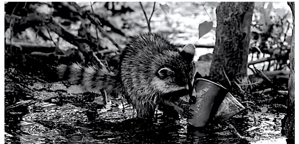
- Raccoon with a cup-

The aim for our project is to create awareness about the shift that is happening. We want to make people aware that what is happening is a danger to us all. We will showcase this through the made up tribe and with the attributes that back up that story and that give body to the project.