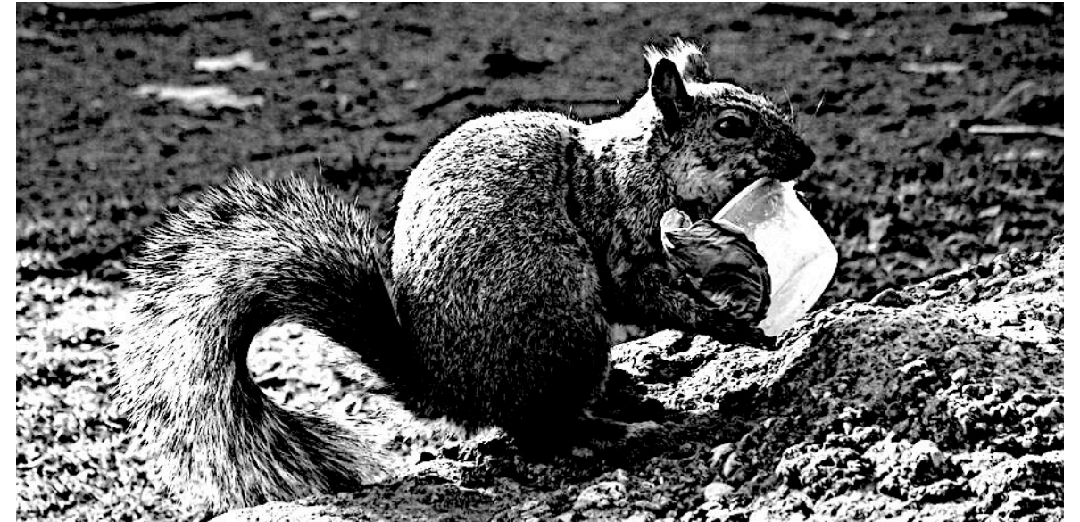
- Squirrel and a cup -