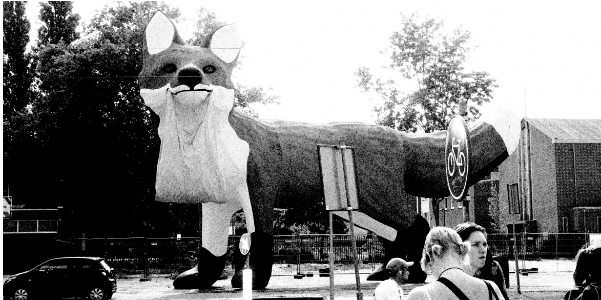
- Fox sculpture in Delfshaven-